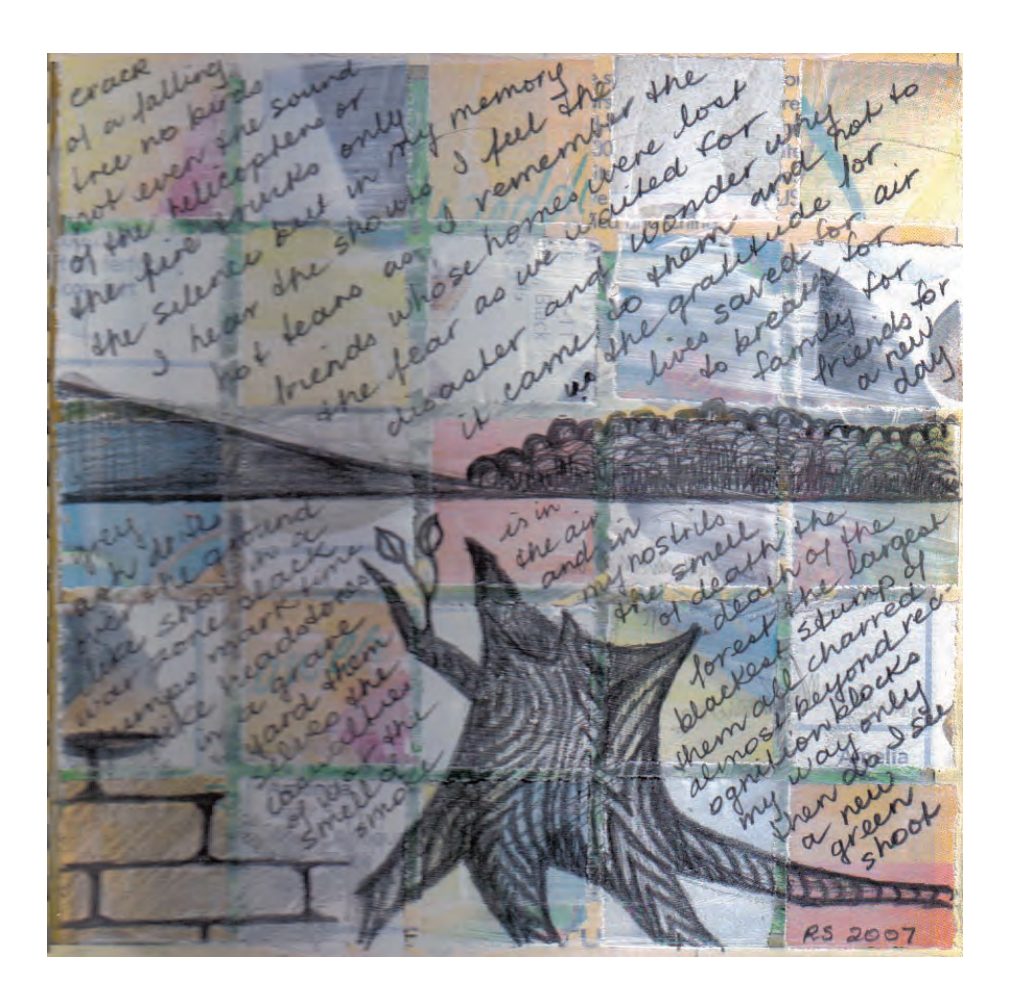
In the silence (Regener8, Rita Summers, p. 56).