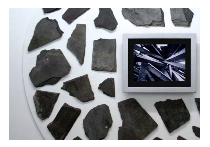
Image VI: Discarded (2006) Collaborator D/ Susan T Grant

The cut-out poetry pages on the Centre's glass windows was created in shared recognition by Grant and Collaborator C that the entrance was austere and required softening. As Collaborator C described, "A house without a flower is like a face without a smile". A comment which reflects not only a personal love of plants and gardening but also gestures towards the very strong civic pride within the community of Aberdeenshire and the obvious value placed upon the maintenance of both individual and public gardens which flourish in the region. In addition, the work invokes the importance of poetry to the Scots, significantly a country that celebrates Burn's Night annually in honour of the birthday of Scotland's most famous poet, Robert Burns.