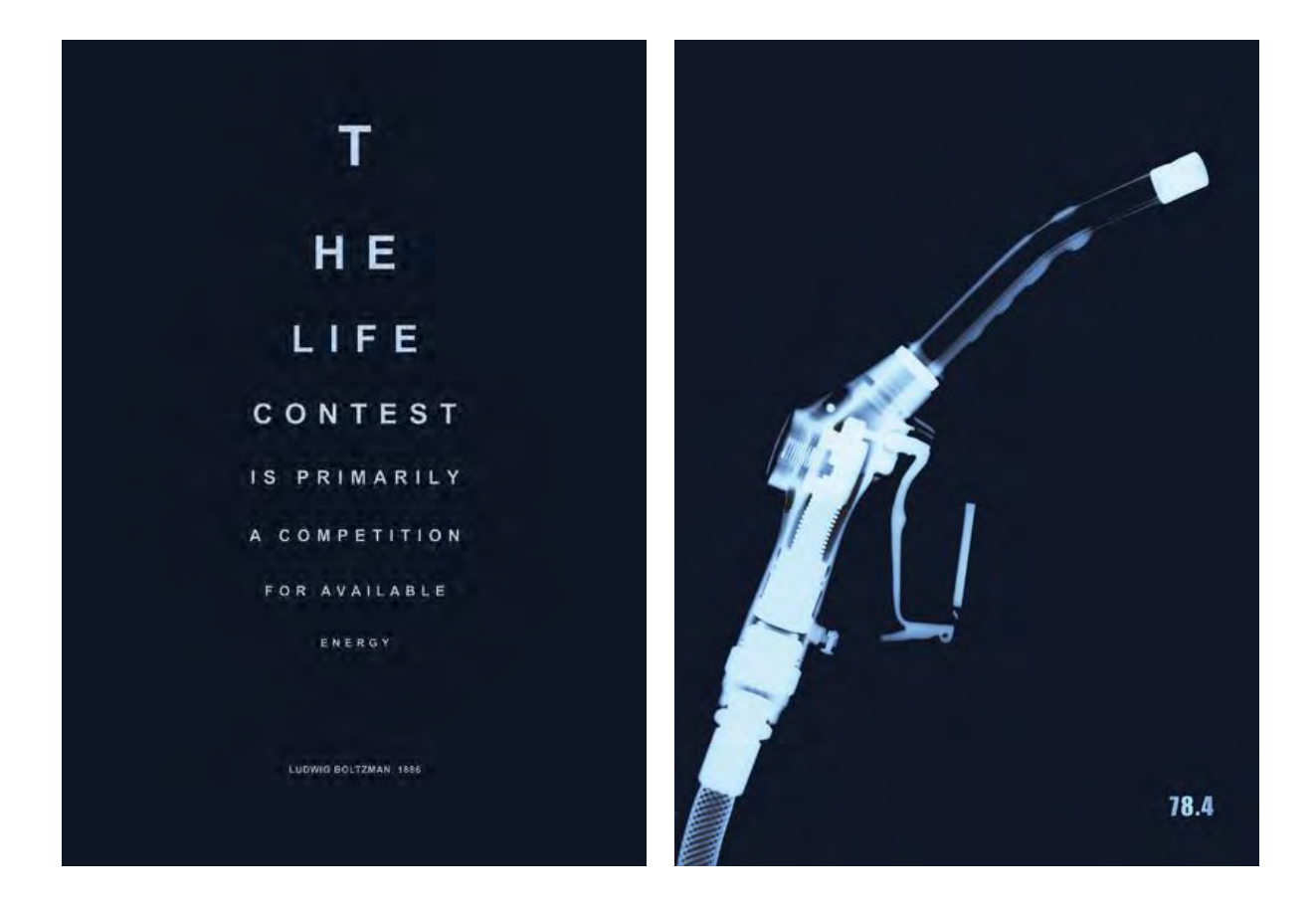
Image III and Image1V: The life contest is primarily a competition for available energy (2006) Susan T Grant

Grant utilised an X-ray machine to create the images and mimicked a medical display, wittily implying the unavoidable impact of oil upon human health and survival, she intensified the work's message. While perhaps not the kind of artwork to expect in the main waiting area of a large health centre, the work's sense of physical threat is countered and balanced by a kind of ethereal and vulnerable beauty.