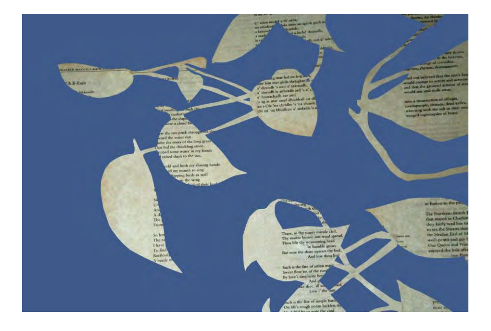
Image V: Leaf Shelter'd: The Devils Ivy Makes Work For Idle Hands To Do (2006) Collaborator C/ Susan T Grant Photograph copyright of the artists and Inverurie Medical Group

The cut-out poetry pages on the Centre's glass windows was created in shared recognition by Grant and Collaborator C that the entrance was austere and required softening. As Collaborator C described, "A house without a flower is like a face without a smile". A comment which reflects not only a personal love of plants and gardening but also gestures towards the very strong civic pride within the community of Aberdeenshire and the obvious value placed upon the maintenance of both individual and public gardens which flourish in the region. In addition, the work invokes the importance of poetry to the Scots, significantly a country that celebrates Burn's Night annually in honour of the birthday of Scotland's most famous poet, Robert Burns.