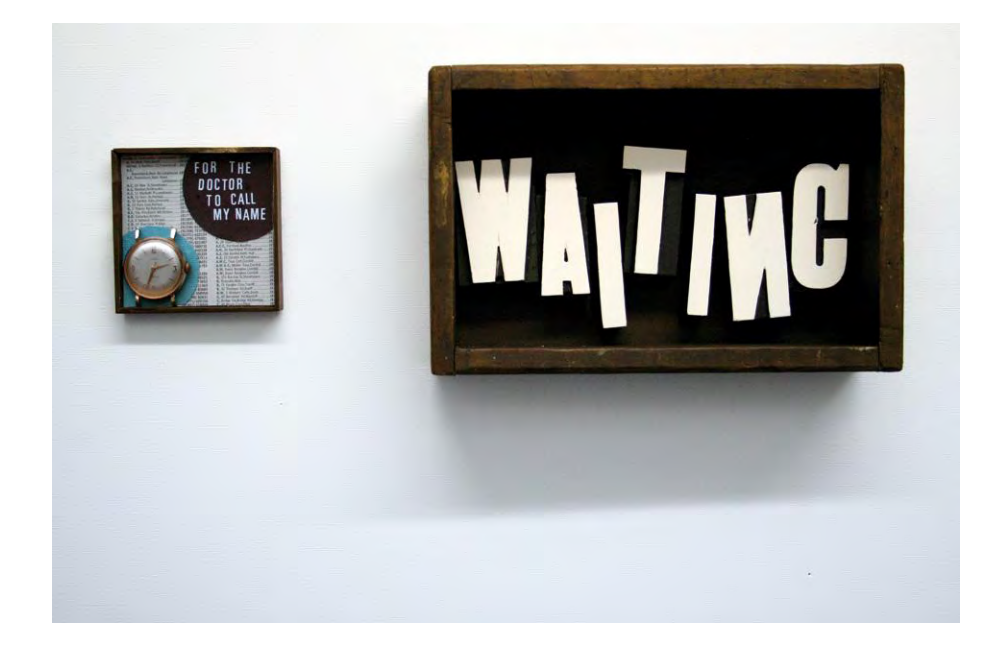
Image I – The Meaning is in the Waiting (2006), Collaborator A/ Susan T Grant

improvement of the environment for both staff and patients, the work addresses a surprisingly wide range of themes and interests. Some of the artworks directly negotiate the experience and role of the Health Centre. For instance, a mixed media assemblage, The Meaning is in the Waiting installed in a waiting area evokes the experience of the visit to the GP and offers some alternative musings on the nature of waiting.