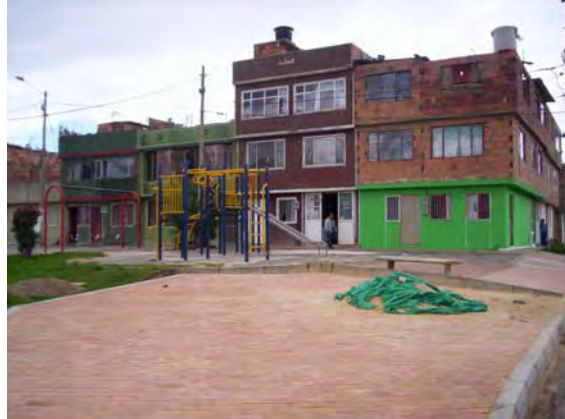
FIG 9 AND 10: SOME SHOPS HAVE BEEN OPENED AROUND NEW PUBLIC SPACES. URBAN SPACE IS KEPT CLEAN AND