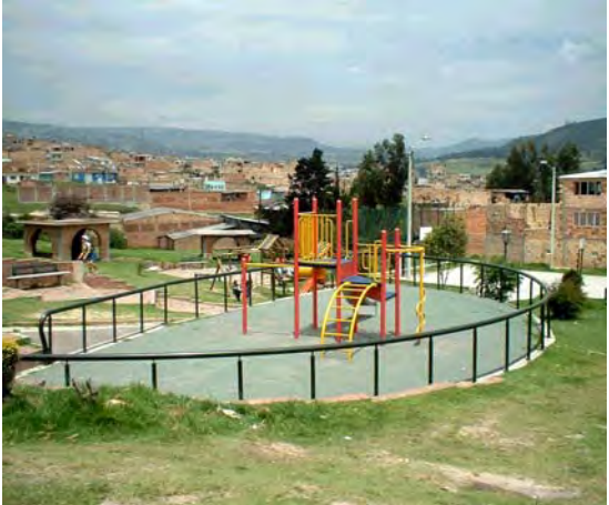
FIG 5 AND 6: GREEN AREAS, CHILDREN'S PLAYGROUNDS AND WELL MAINTAINED SPACES