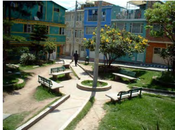
FIG 7 AND 8: COLOUR APPROACH DEVELOPED BY THE COMMUNITY. PLAYGROUNDS BEING USED BY THE CHILDREN