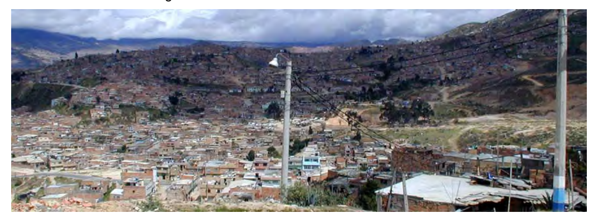
FIG 1: LOW INCOME SETTLEMENTS IN BOGOTA

The magnitude and impact of low-income settlements in Colombian cities is huge, because of the population they have and the portion of the city they engage. Colombian cities are still growing – especially boundary sectors – not only because of demographic factors, but also as a product of forced and voluntary displacement (the refugees initially settle down, in the main in a definitive way, in the periphery). Nowadays, in cities like Bogotá the inhabitants, without 'interference' of any private or public planning institution, have developed more than 50 per cent of the urban fabric spontaneously. People themselves have built and improved their own habitat, have built and shared their dreams and ideas about the future, have built a community vision not always explicit but always 'there', have used formal and informal participation channels to achieve their goals.