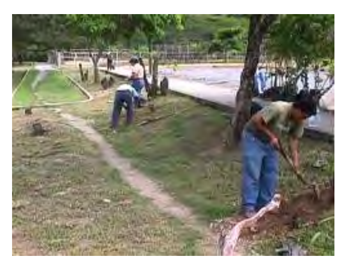
FIG 2: PEOPLE AT WORK IN AN UPGRADED PARK

It is perhaps the most important common characteristic of the studied projects, the possibilities that the development of the project leaves the people. The knowledge, the methodologies and the management experience are tools that communities acquire and they can be very useful for other projects the community may want to develop. This outcome is very much related to the possibility of having had any help, assistance and capacity from a public