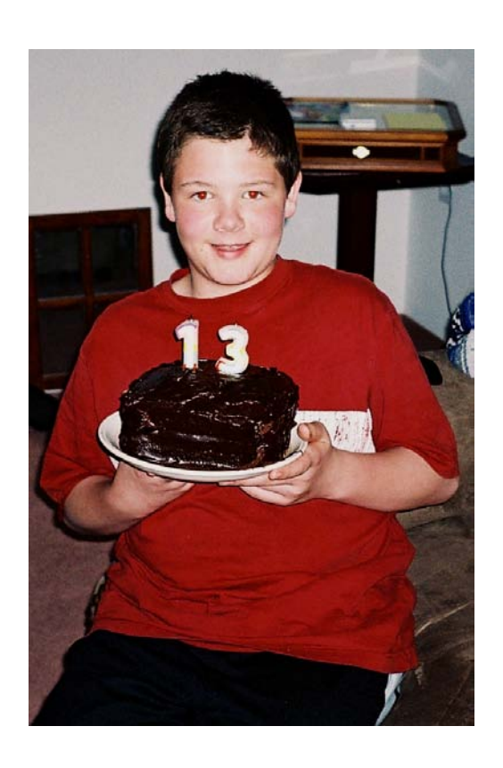
Being a Teenager

Here I am holding my 13<sup>th</sup> birthday cake. I like being 13 because it makes me a teenager. Being 13 makes me feel bigger and more mature. Even though I don't act mature, I also don't feel like a little kid anymore.