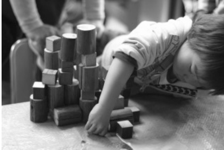
Figure 6. Making blocks with disused house's old woods

Participants are concerned with children and want to share the pleasure through arts workshops and events. At once they look for an opportunity to participate from the beginning of planning. At the same time, they look for an opportunity to learn about such a manifold area as on the job training.