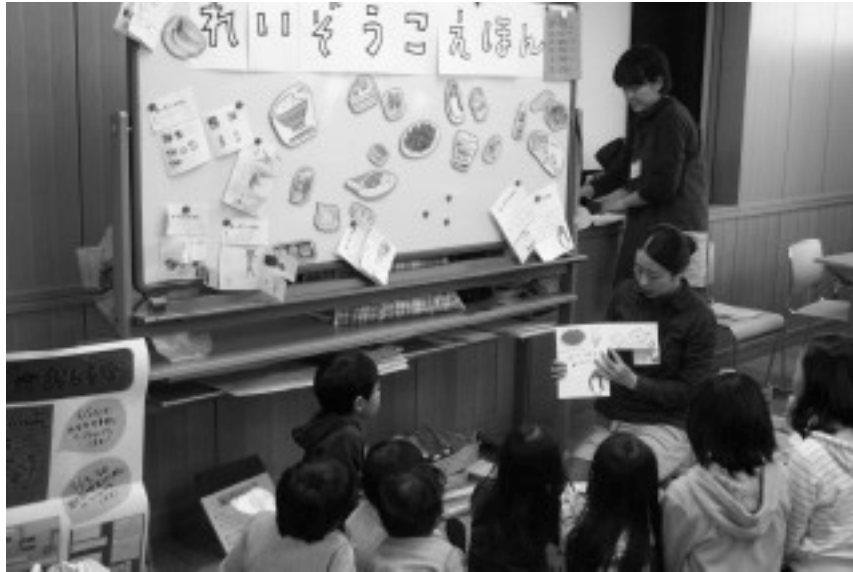
Figure 4: Refrigerator picture book design work shop

This ratio indicates that half of the participants are concerned and interested in children's art activity and education through arts. On the other hand, 16% of business person are important, although, they are not artist and had no training for arts education or teachers college, they are people who wish to contribute to arts education for children in the community. Besides citizen activists and homemakers concern for arts education, it might enable the hypothesis that there are a group of people who are concerned about arts education for children although they have no special arts education training and they are willing to start an arts education activity in their nearby community. I suggest that there is a necessity for a program to enable the training of community arts educators. The desire of participants to participate in a project such as CAF is important. In the following the participants' reasons for participating in CAF are listed.