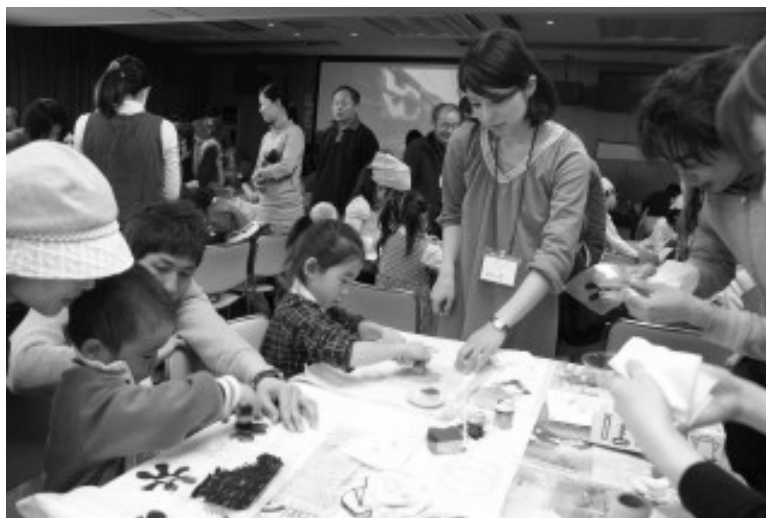
Figure 7: Making traditional dying towels

In chapter 6, the participants' views show what is necessary for their community arts education activity. In the questionnaire form that they filled out after CAF they described what kind of study was necessary for them. The description is as follows.