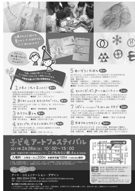
Figure 3: flyer of CAF reverse