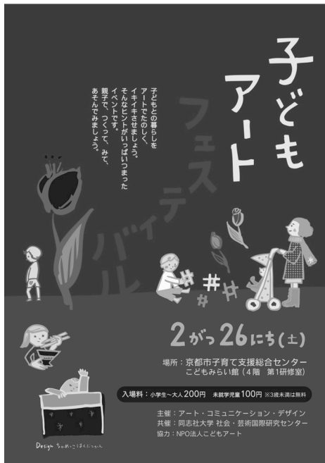
Figure 2: flyer of CAF front