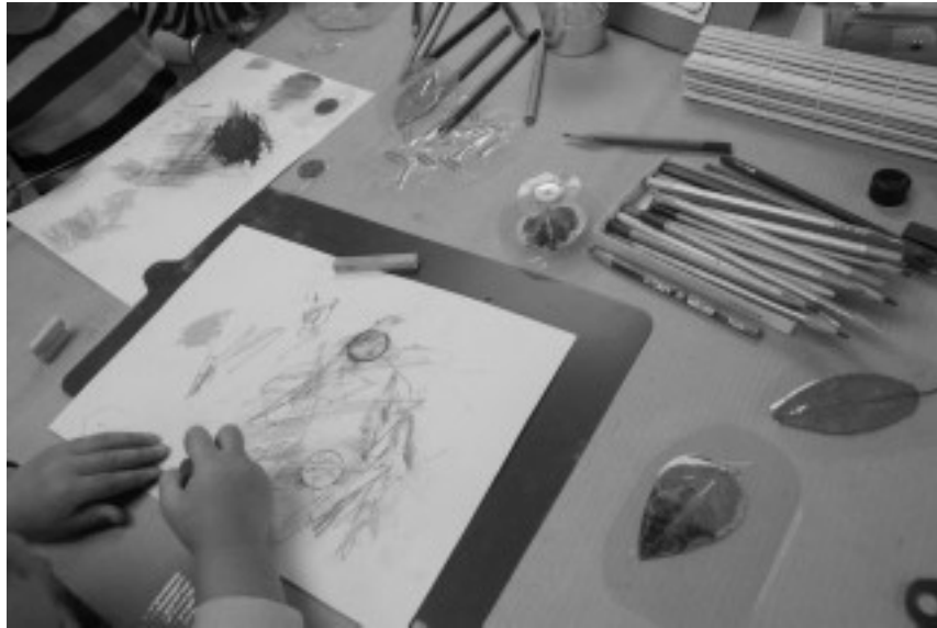
Figure 5: Scratch drawing

This data suggest the following. Firstly many participants are concerned with children. They want to feel the children's pleasure and power of imagination and not for the desire to exercise their ability of expression or educational arts technique. Many participants believe that children's viewpoint is very important. As I said earlier, most of them did not have any special training experience and I recognized that they possess such an attitude as non-professionals, indicating that recognition of the goals of arts education exists among common people. Participants receive pleasure from caring for children. I can say that there is a reciprocity by the communication through arts and it is a new effect of arts as a communication (Kumakura, 2000). 1990s Arts expression style has changed to making arts work as workshop and project work, it includes appreciators and citizens. Communication became a key concept in the contemporary Arts scene. Artistic objects are not necessarily needed for Arts communication today; however they want to have a deeper understanding of children's feelings. There are possibilities to make communication with Arts as communication.