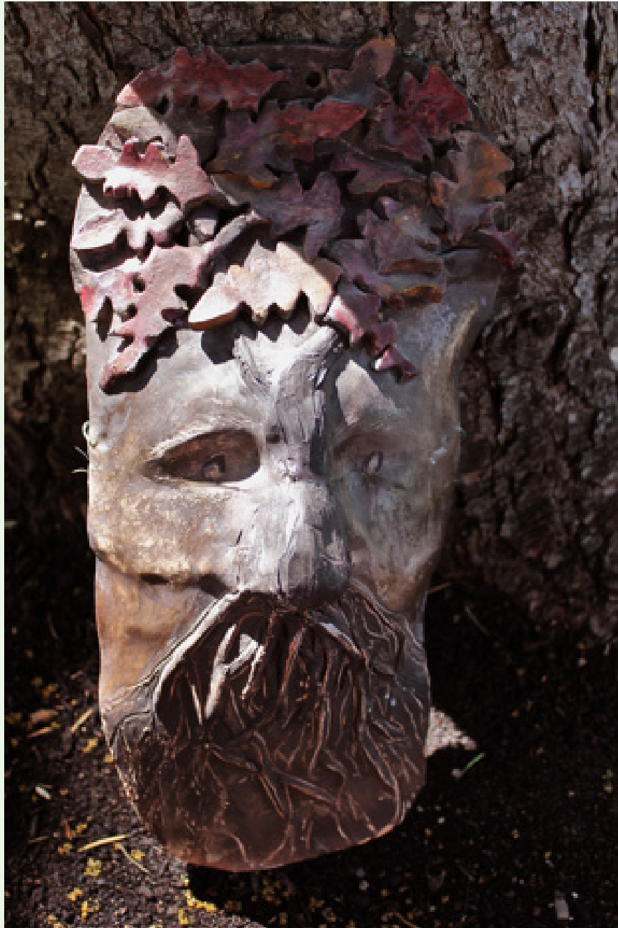
Figure 11 Developing Roots and Branches

Authorship, through all its modes of representation, involves constructing new meanings and new identities and interconnecting these meanings to the understandings of other — a continuous branching and re-rooting. Friere touches on these ideas as he speaks about the role of man: