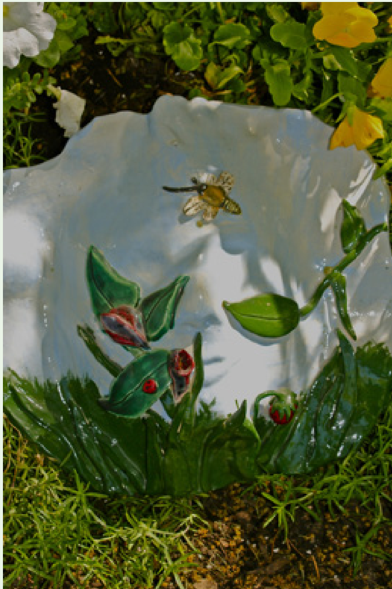
Figure 6 Blossoms of Late Adolescence and Early Adulthood

Summer was a warm season — a period of great happiness and cumulative successes. I pushed through barriers and spread my branches, expanding my knowledge about writing, teaching, researching, and art-making (See Figure 6).