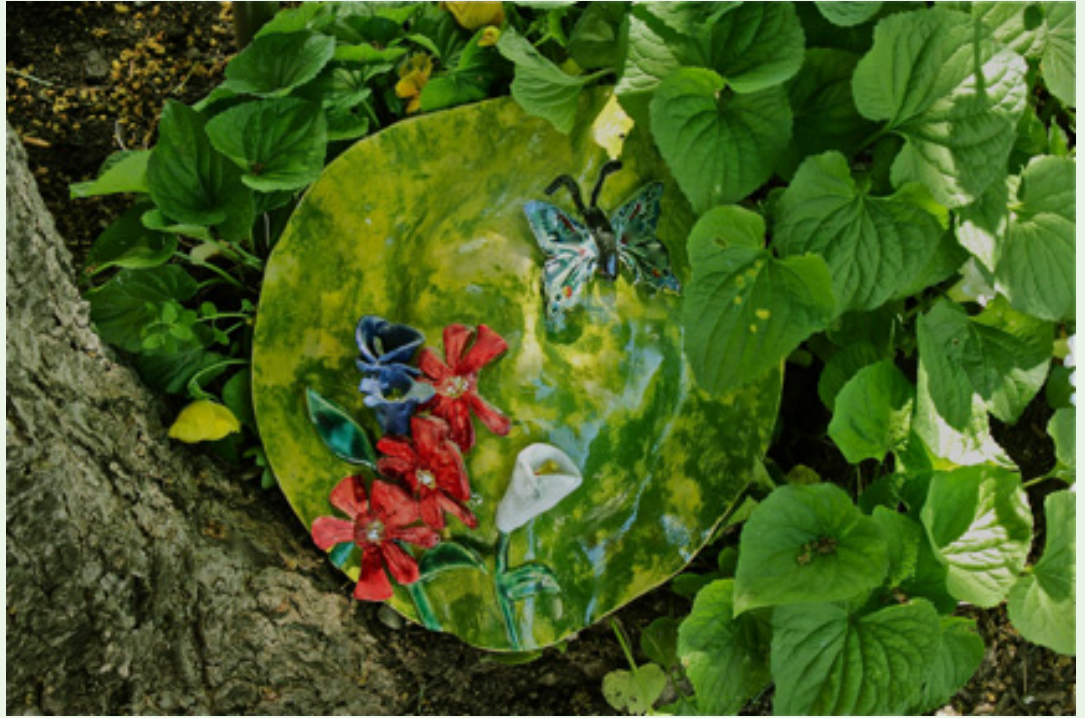
Figure 1 A childhood of springs

For what kind of power could there be in an acorn....What lessons could it teach [her]? (Casler 1994).