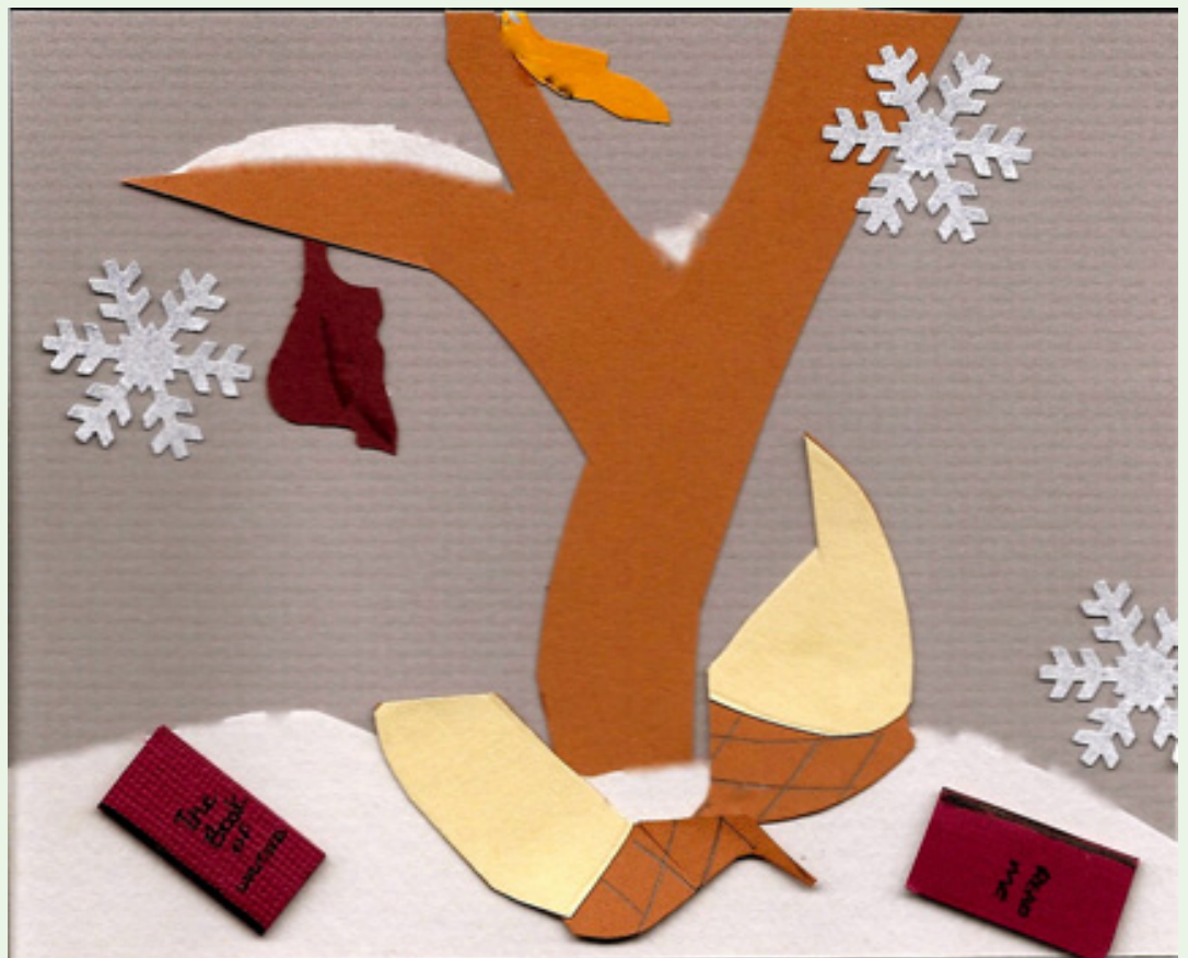
Figure 12 Trust in the process

Like the oak, weighed down by snow and covered with frost, I know that I can stand tall, looking forward to new beginnings when spring sings again (See Figure 13).