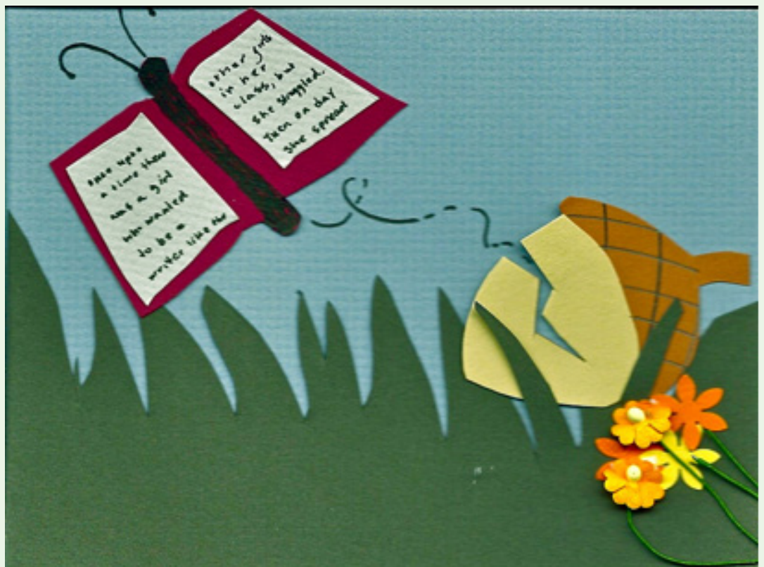
Figure 4 Disruptions and openings: Freeing myself from assigned positions of illiteracy

Davies and Harré (1996) suggest that power is also flexible, because people have agency and because relationships shift within each new context or situation. People can speak back to systems of power or contribute to new conversations, assuming different positions, or pursuing alternative storylines. Rather than continuing to assume the role of an acorn, I refuted this claim, refusing to be positioned as an illiterate (See Figure 4).