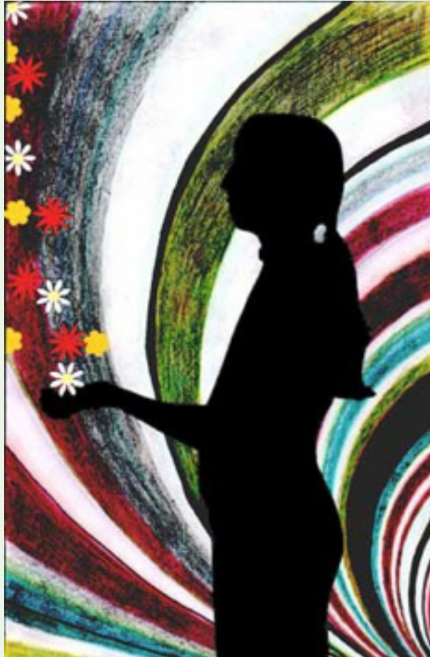
Figure 7 Great happiness and cumulative successes.

In my twenties I moved away from home, travelled the globe, and studied theatre, specifically the ways that one uses the voice and the body to write a story. Other forms of knowing that I learned about in this season included visual art (See Figure 7), clowning, set/costume design, prop construction, light and sound design, carpentry, mime, and playbuilding.