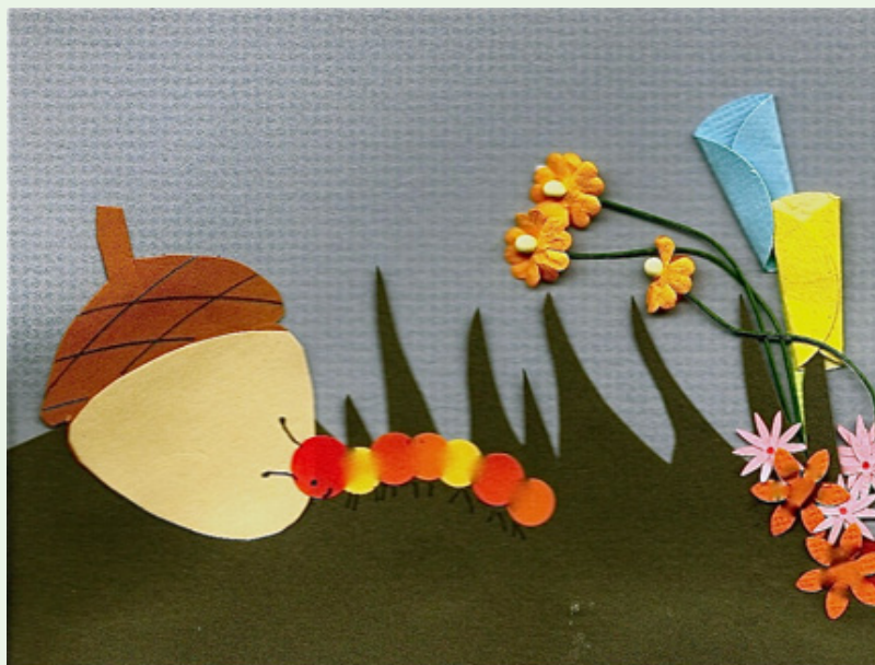
Figure 2 What kind of power could there be in an acorn?

Through an illustrated North American myth, Casler asks about the power of seemingly insignificant items such as an acorn. As I study my own literary and artful life, I ask similar questions, specifically about the position of insignificance.