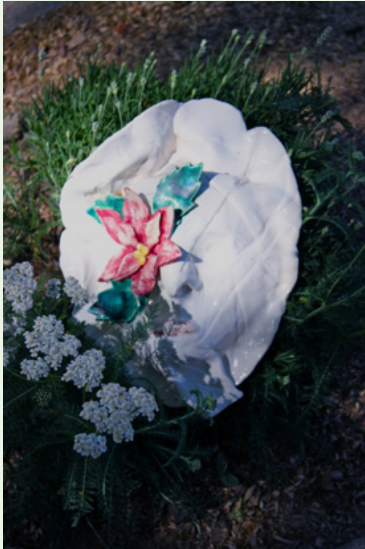
Figure 14 Being simultaneously inside and outside of the fold.

Meaning-making is always situated within individuals and their larger social and cultural frameworks. By assuming both stances (composer and communicator) the writer learns to “live poetically” (Leggo, class notes), discovering an infinite amount of ways to engage with and be in the world (Britton, 1970, p. 58).