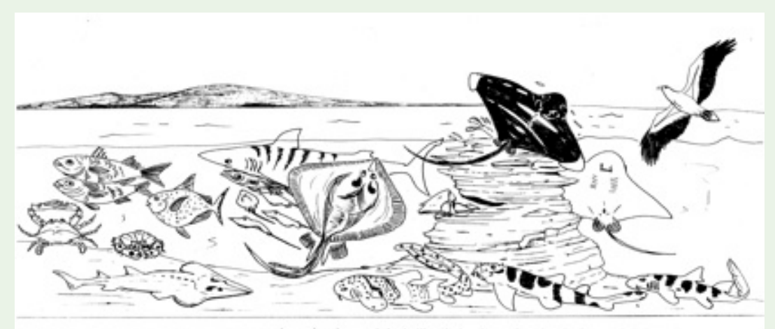
Around and around the kujika circles the reef at Nungkariwurra, it is here that the Manankurra Rrumburriya men hand over the kujika to the Rrumburriya men of Vanderlin and North Island. The kujika circles and then moves eastwards to Yulbarra.