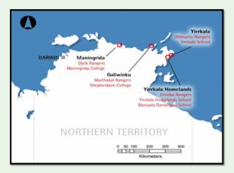
Figure 1 Learning on Country Communities, Schools and Ranger Groups, 2014

This paper involves an exploration of the concept of 'Learning on Country' as manifest in a new approach to education in a small number of Indigenous communities in remote parts of the Northern Territory in Australia. In the sections that follow we discuss what that concept entails, where it came from and what it means to the various stakeholders. In our many combined years of working with people in remote regions we have never seen an educational program greeted with such enthusiasm. Yet, while the level of enthusiasm is high, little attention has been paid to what we believe are some fundamental differences among various stakeholders in terms of their perceptions of Learning on Country rationale, aims and outcomes; these perceptions are sometimes quite subtle or even invisible, yet they reflect some important tensions that have the potential to jeopardise what appears to be a very promising model. In this paper we explore these differences and draw on learning theory to suggest a pathway toward a deeper understanding of the enormous potential in Learning on Country.