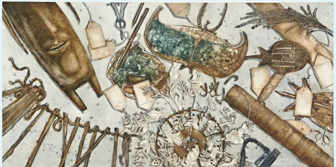
Figure 1 August 23 1898

The sculpting of turtleshell required extreme skill. Flakes of shell were heated in boiling water, molded into the desired forms while hot and pliable and then left to cool. Once hardened, the shaped plates were then assembled and strung together using sennit, a braided cord handspun from natural fibres, then ornamented with seeds, shells, cassowary feathers, human bones, ochres, natural fibres, human hair, fretwork and engravings. Wooden masks referred to as mawa, were used particularly in the Western Islands. It is possible these masks originated in Naigai Dagam Daudai (Papua New Guinea), as the Torres Islanders have a long history of importing objects, especially wooden ones like canoes and drums, from Papua New Guinea. Once obtained, the Islanders then refined these wooden masks before applying decorative elements. The influence of the missionaries had a