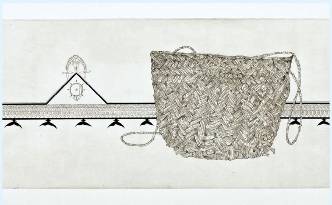
Figure 2 Woven ware

With the introduction of Christianity came new western attitudes, influences and implements, and it wasn't long before these new materials and tools were widely accepted. Two-dimensional painting emerged as the dominant form of artistic expression. The suppression of traditional religious practices in favour of Christianity altered the way Islanders expressed their culture. Dance now emerged as the pre-eminent cultural practice around which secular activities revolved. Island artists now redirected their energies into the creation of dance paraphernalia, the elaborate and articulated dance machines and percussion instruments. Weaving remained popular with