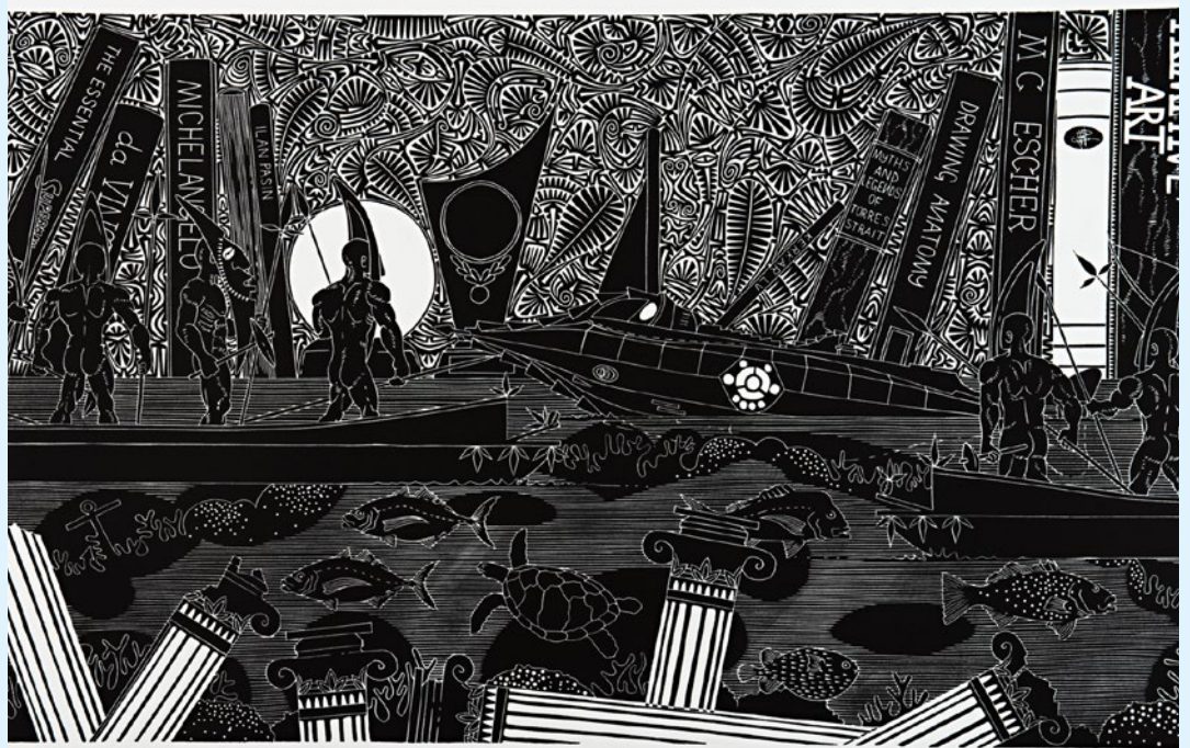
Figure 3 Navigating narrative

black and white combinations. Elegant rhythmic, rippling strokes keep the viewer's eye engaged, and a fineness of line combined with flat tints and shaded areas results in spectacular effects. Themes from the legends and myths of the Torres Strait often form the print's narrative. The symbolism of these engravings is immediately obvious. The clear connection to tradition lends strength to the works, affirming the artist's cultural beliefs and affiliations. These artists are working not only in union with their culture, traditions and history but are also responding to their contemporary environment: urbanisation, western influences and the appearance of new techniques. Urban Torres