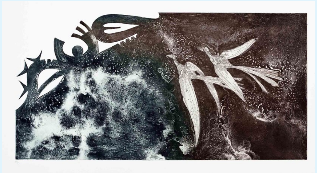
Figure 5 they spread their wings

While the Europeans used sea charts and rhumb lines to navigate the oceans of the world, the Islanders of Zenadh Kes navigated by the stars. Nature provided markers for successful and accurate open sea navigation: the life cycle of the seasons and moon's phases, the rising and setting of specific constellations, the weather and the seasons, and the movement of animals in the sky and in the sea, gathering at particular locations. Islanders gained experience and familiarity with important phenomena, guided by ocean waves and their orientation, scale and velocity, the colours in the sea and sky, and the formation of clouds, which cluster over islands and reveal their location before they emerge over the horizon. My creativity is driven by connections like these and the resulting visual language of my work is a consequence of my Melanesian heritage. My art serves as a cartographic system, designed to produce and preserve knowledge of the traditional culture and sense of belonging of Island people.