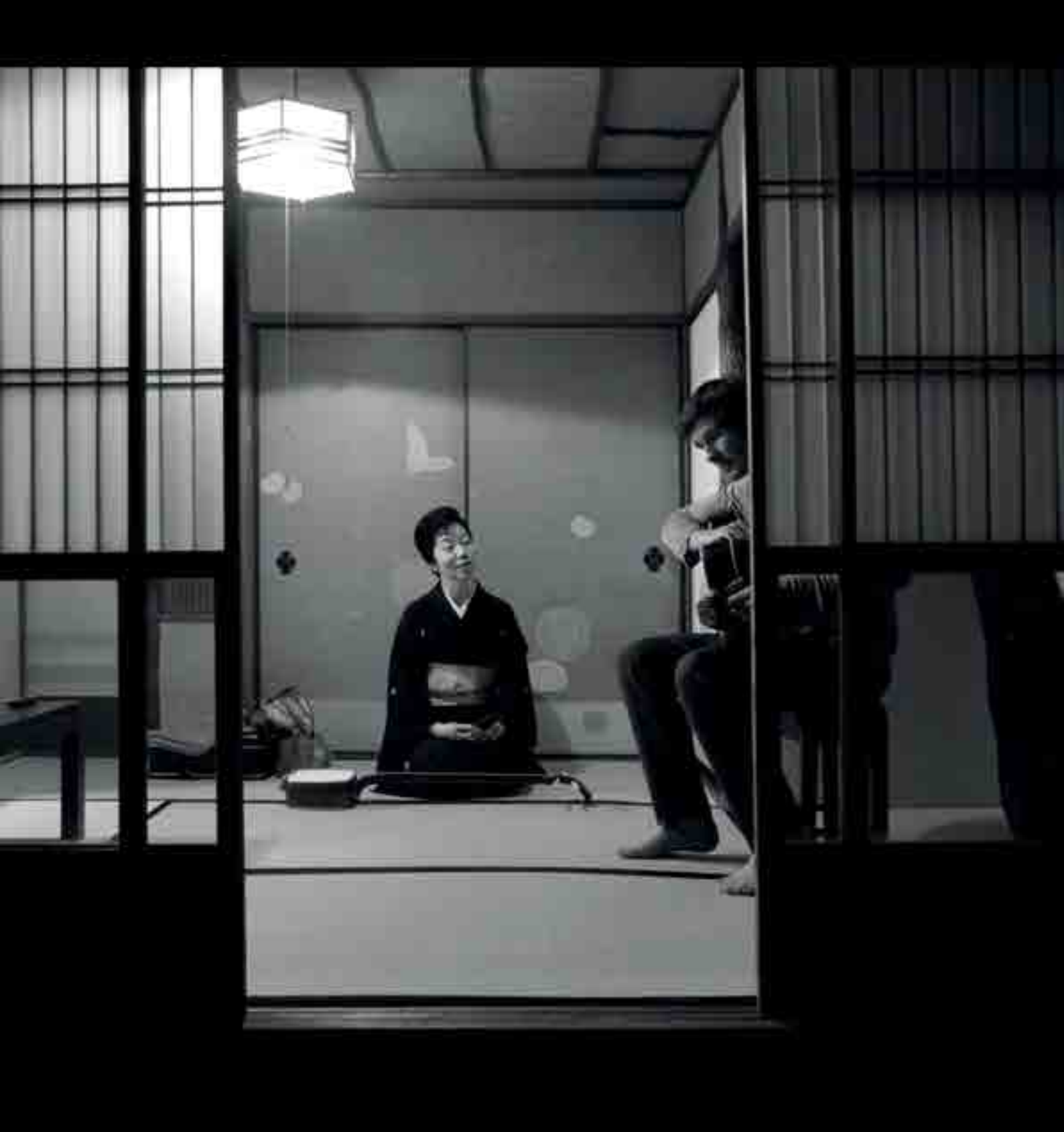
FIELD RECORDINGS, KYOTO