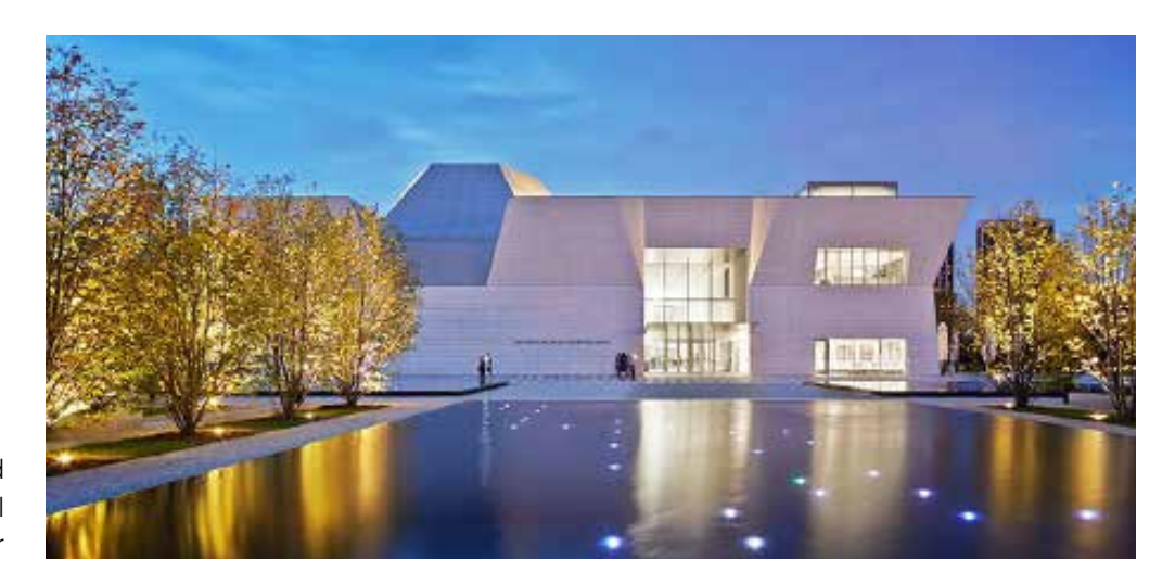
Figure 1 The AKM building and reflecting pool

The Aga Khan Museum (AKM) in Toronto, Canada is a building clad in white granite, set in a park on a hill. Seen from afar, in the evening when its windows and skylights glow with light, it seems to say, 'Come, everyone, and experience the wonders within. You are very welcome here.'