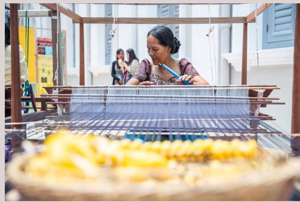
Figure 2: Maybank Eco weavers Programme – Entwine 2019, Maybank Collection.

Through the Maybank Women Eco-Weavers programme, we sustainably promote traditional textiles whilst creating economic independence and financial inclusion of women weavers across the ASEAN region. Though the Maybank Women Eco-Weavers programme is essentially an economic empowerment programme, we have discovered that the strong cultural and artistic element in the region's weaving heritage can speak to larger issues and make greater connections.