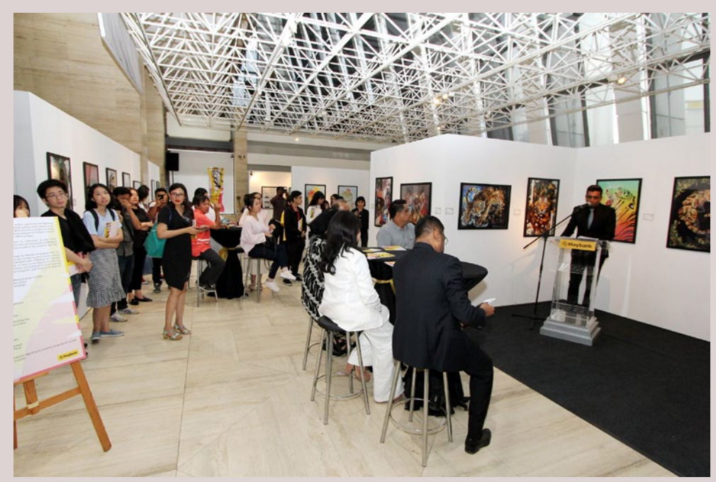
Figure 3: Maybank, Gallery expanse, My TIGER Exhibition, Maybank Collection.

In its third year, Maybank Foundation's " MyTIGER Values Art Competition & Exhibition ", showcased a fusion of fresh ideas on what Tiger Values (Teamwork, Integrity, Growth, Excellence & Efficiency, Relationship building) entails and how they inspire Malaysia's young aspiring artists. The 2020 competition saw entries from 316 art students from 68 Malaysian universities, submit for categories: Sequential Art, Illustration Art and Photo Imaging Art. Out of 430 artworks submitted for the Art Competition, our art exhibition featured works of 119 finalists, showing particularly refreshing perspectives. We were able to create a digital virtual gallery with state-of-the-art technology to feature and share the show with all who visited and continue to visit the website link. Celebrating greater accessibility! (See: https://maybankfoundation.com/mbfvr/#media=1)