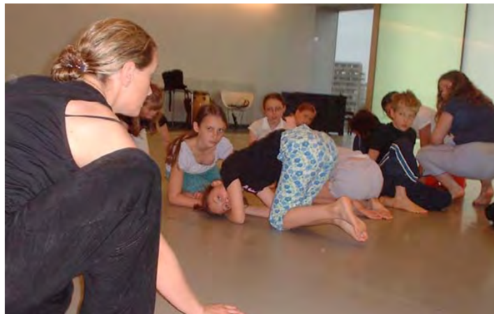
Figure 2: One of the teachers and her group shaping the dance

Interactions between teacher & child creativity occurred through the dance teachers ensuring that their own creativity as artists was allowed authentic space in children-teacher collaborations (see Figure 2). As a funded professional choreographer as well as a dance teacher, one of the teachers noted: "The way I work as a choreographer...isn't actually that different from the way I work with the kids...things that students come up with, you think that's really interesting...I'd never thought of it in that way". Unusually perhaps, this highlights the teacher creatively alongside, rather than always hierarchically above the children, as another member of the group to be treated humanely. These children were creatively interacting with teachers who admitted to be learning from them, potentially placing themselves at risk, and requiring the children to respond to the teacher's 'not knowing' with empathy and consideration.