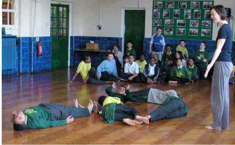
Figure 6: Trying out improvising in performance: the children in the background take the audience role, those in the foreground improvise a 'p' as requested by the practice audience

One of the defining characteristics of communal creativity, the developing group movement identity , echoes Bond (1994). She analysed the influence of an intense dance programme on social and task engagement of a group of six nonverbal children, and drew out the concept of 'aesthetic community', characterised by shared aesthetic values, heightened group relatedness, reciprocal communication, celebration and collective style. The dance teachers' conceptions of and approaches to creativity within this study show structural similarity to those found by Bond (1994). Group movement identity developing through cross-fertilisation and children's appreciation of each others' work found here are reminiscent of Bond's collective style of movement and shared aesthetic values.