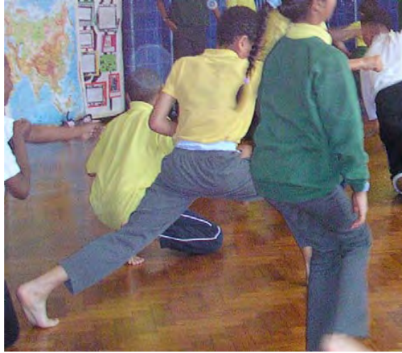
Figure 5: Martial arts movements feeding into group movement identity

Appreciation of these new ideas could be seen cross-fertilising ideas. Often children could be seen working individually on solos, cross-fertilising using movements from others, to develop their own new variations. One of the teachers went so far as to label some of these movements: 'labelling... if I talked about sharp scissor blade movements – they would know that...so there's a shared vocabulary'.