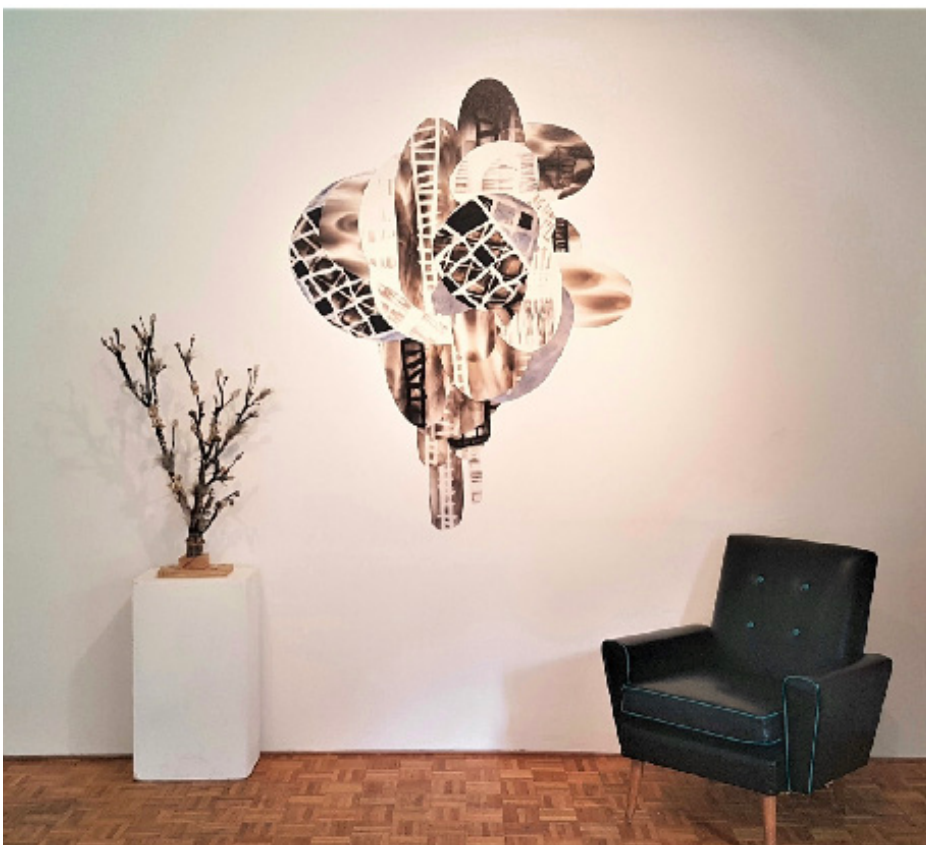
Figure 4. Gabrielle Bates, Spirit Map 1 (Camperdown) in situ, 2017, digital print on wallpaper, 1.7m x 1.2m, Chrissie Cotter Gallery, Camperdown

These early experiments paved the way for my research to explore other ritual processes, which resulted in the production of three-dimensional fetish objects such as protective amulets and talismans, and community-based actions involving the ritual veneration of endangered trees.