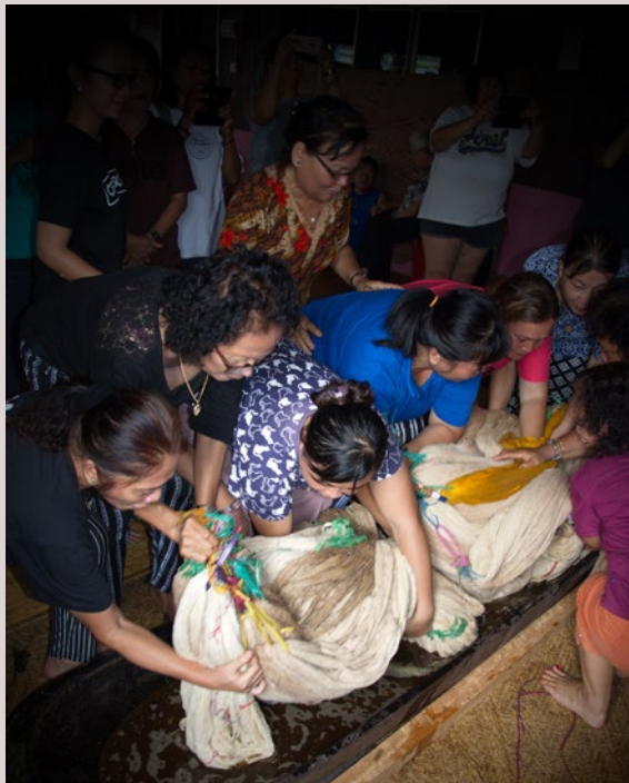
Figure 2: The process of 'pre-mordanting' the cotton threads, known as 'Ngar'.