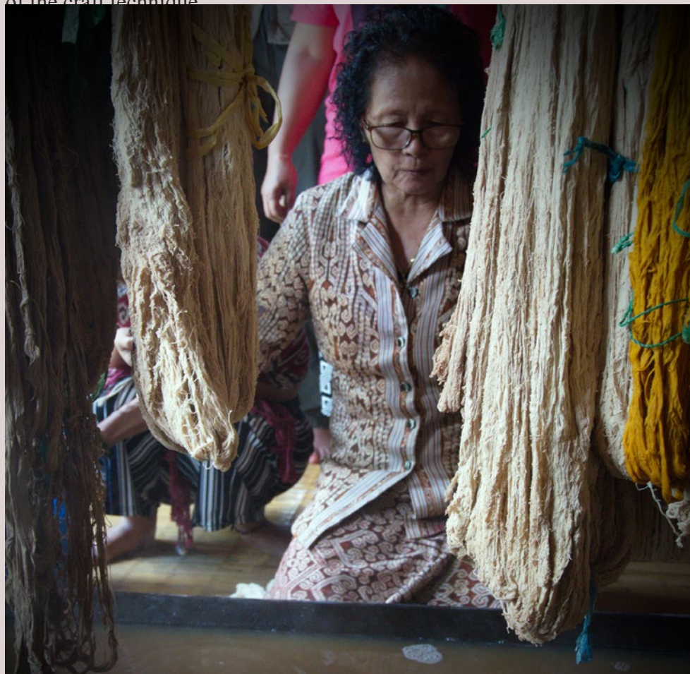
Figure 3: Bangie Embol Ngar ceremony.

Q: Would you elaborate on your initiatives for developing and preserving the Pua Kumbu weaves? Has the practice been saved? Are there effective sustainability measures in place?