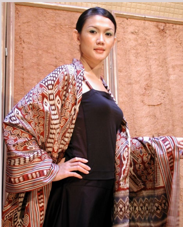
Figure 5: A handwoven silk Pua Kumbu wrap.

In my own experience, three prominent Chinese embroidery artists who we featured in the WEFT art exhibition at the SOAS Brunei Gallery, London in 2014, had their exhibited works donated by their government to the British Museum (whose curators personally selected and confirmed the artists' work). These were worth 500,000 British pounds! A landmark value for contemporary embroidery art! Much earlier on, after the Pua Kumbu- Ikat Textiles of Sarawak, Malaysian Borneo (2000) exhibition at the Ethnographic Museum in Gothenburg, Sweden, the museum purchased the entire collection.